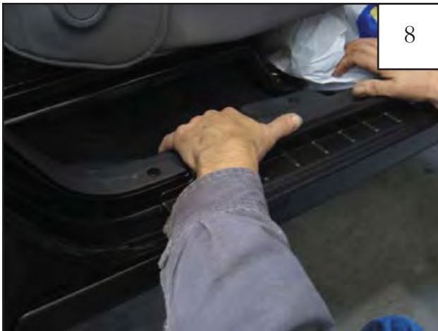
Press down firmly on part along the length of the sill.