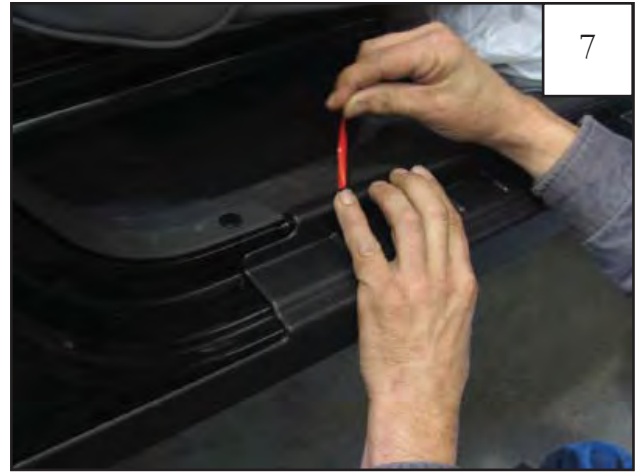
Pull 1/4" tape liner tab 2. NOTE: Refer to step 1 for additional tape tab identification.