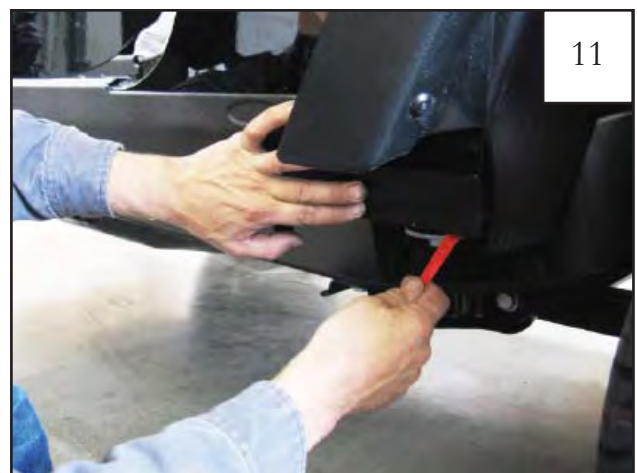
Toward the front of the vehicle, pull 1/2" tape liner tab 5. Press firmly on the part following tape liner removal. NOTE: Refer to step 1 for additional tape tab identification.