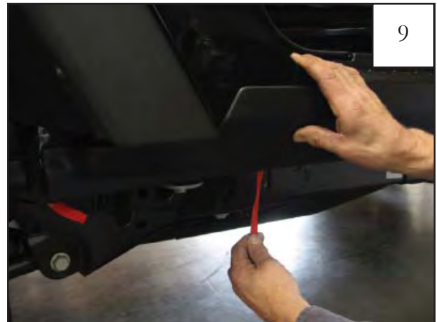
Toward the rear of the vehicle, pull 1/2" tape liner tab 3. Press firmly on the part following tape liner removal. NOTE: Refer to step 1 for additional tape tab identification.