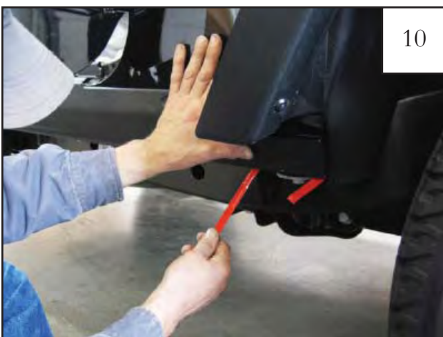
Toward the front of the vehicle, pull 1/2" tape liner tab 4. Press firmly on the part following tape liner removal. NOTE: Refer to step 1 for additional tape tab identification.