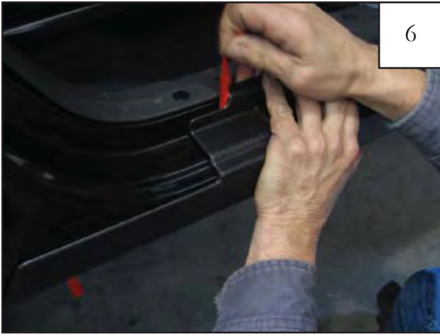
Pull 1/2" tape liner tab 1. NOTE: Take care not to catch tape liner of other pieces of tape and accidentally pull their liners off as well. NOTE: Refer to step 1 for additional tape tab identification.